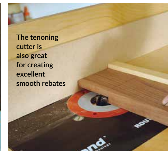
The tenoning cutter is also great for creating excellent smooth rebates