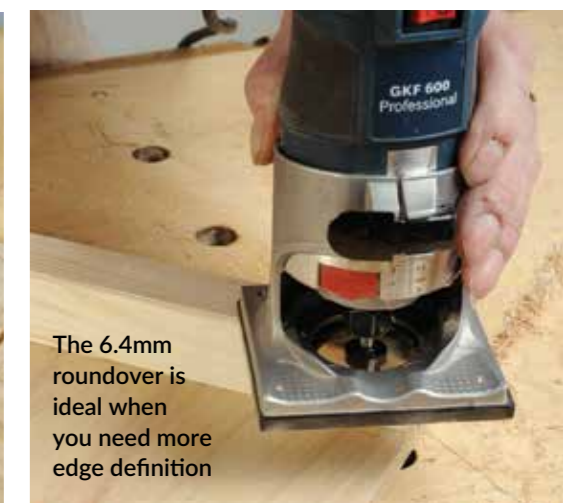
The 6.4mm roundover is ideal when you need more edge definition