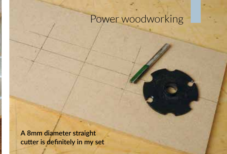
A 8mm diameter straight cutter is definitely in my set