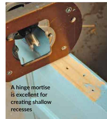
A hinge mortise is excellent for creating shallow recesses