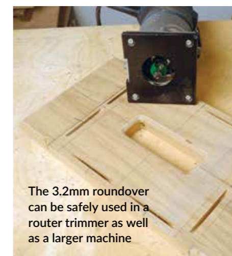
The 3.2mm roundover can be safely used in a router trimmer as well as a larger machine